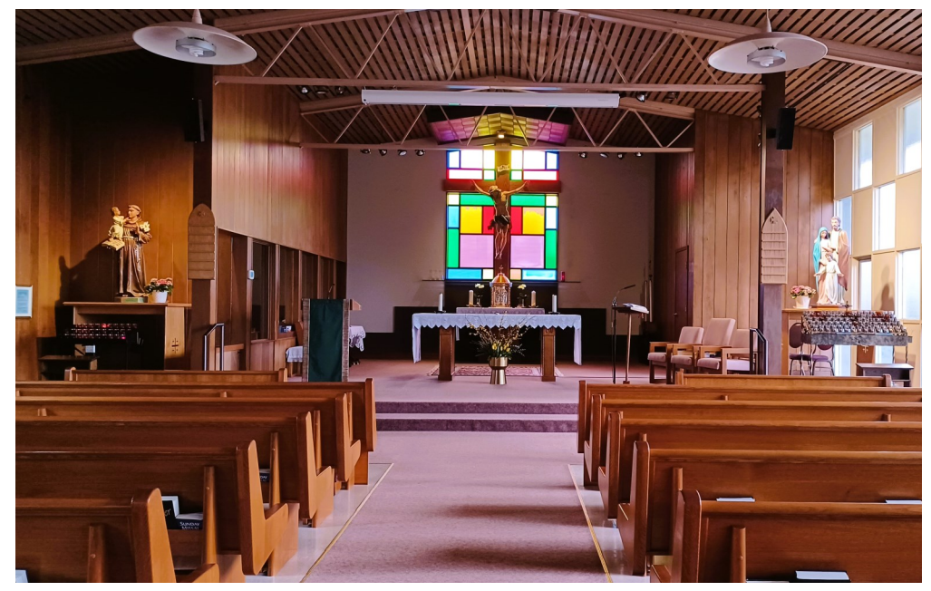
6th Sunday Ordinary Time February 11, 2024